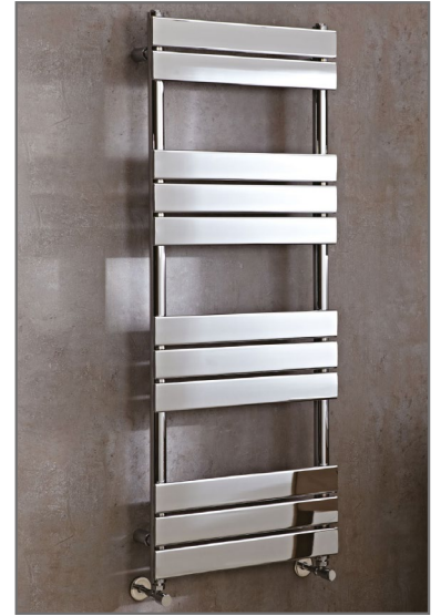
1300 x 500 Image Shown