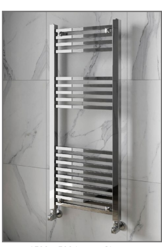
1500 x 500 Image Shown

This product is designed as a warmer of dry towels. Placing wet towels or garments on this product may result in the deterioration of the surface finish.