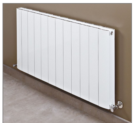
600 x 1124 Image Shown