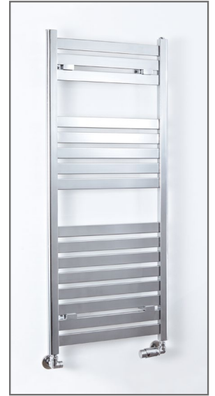
1200 x 500 Image Shown